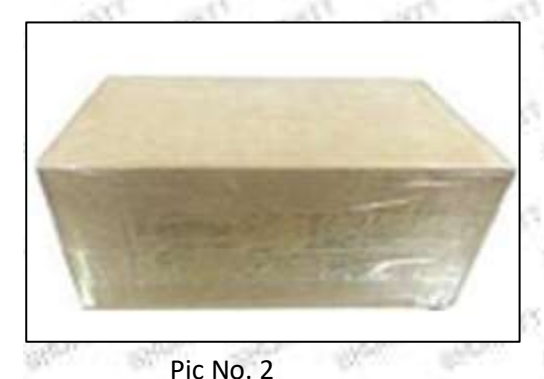
Domestic express packaging: Wrapped with Transparent tape

Minors are prohibited from using transparent tape, yellow tape, black wrapping protective film, and white wrapping protective film to avoid personal injury.