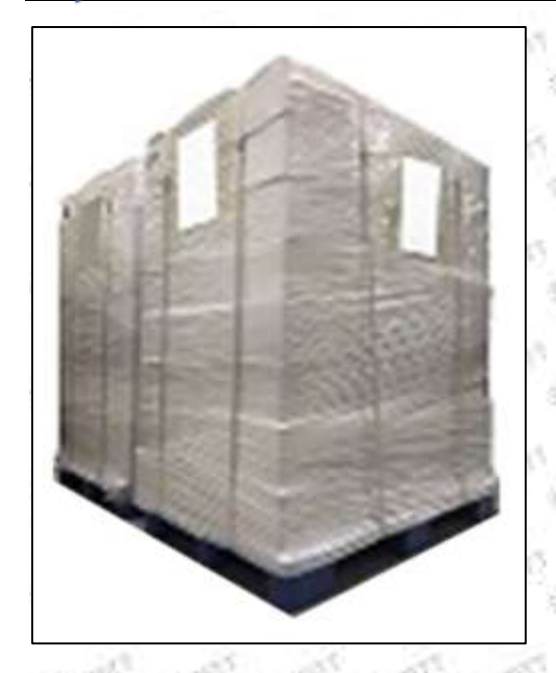
Pic No. 4

Pallet Shipping: Use pallet that meet export requirements, and use white wrapping protective film to wrap and bind with cable ties