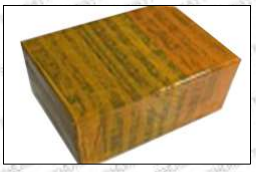
Pic No. 3 International express packaging: Wrapped with yellow tape after wrapping black protective film